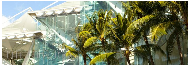
ALOHA AND MAHALO