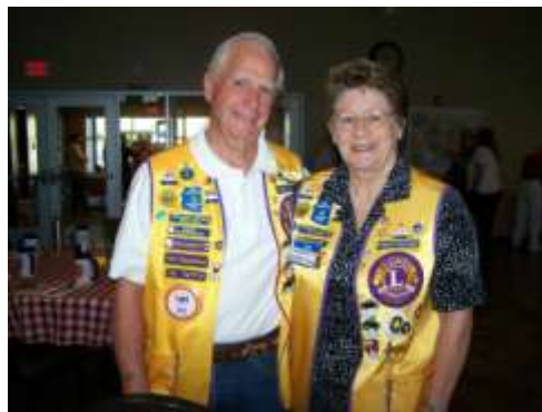
Our Lions at the Salvation Army Thank You Brunch